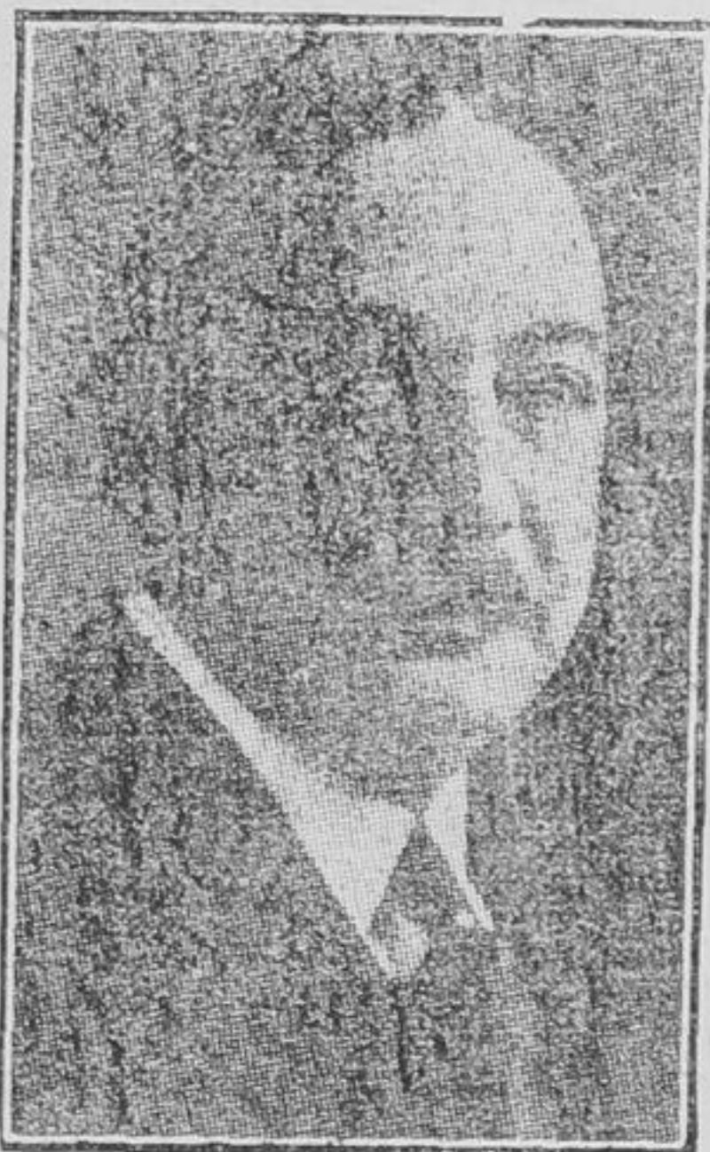
Sir Mortimer B. Davis.

Imbued with an unwavering faith in Canada's future, he is keenly interested in every phase of its commercial and agricultural development, and his belief in the destiny