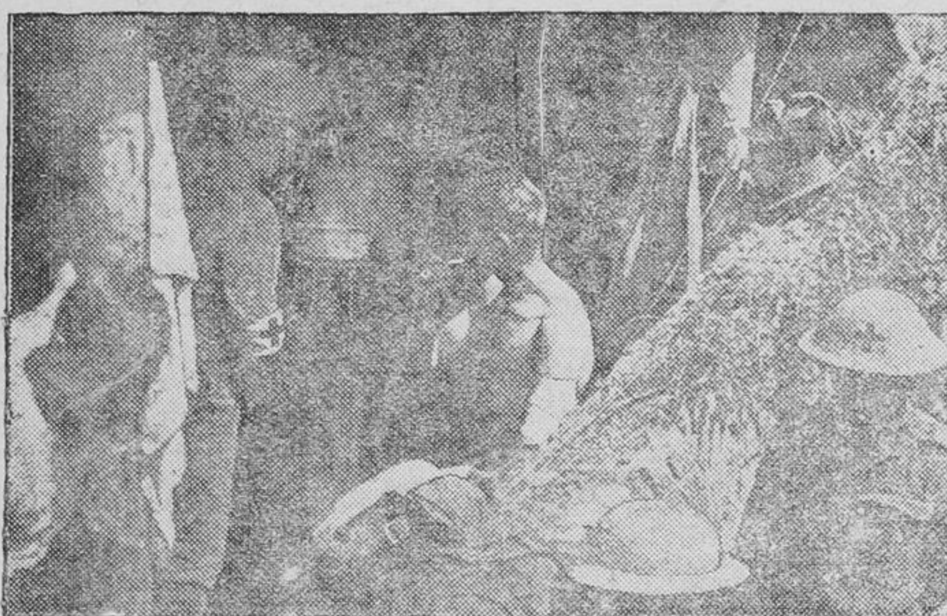
Dressing Station, Firing Line—Official Film, "Battle of the Somme."

An urgent call for help again goes forth from the Motherland's mighty life-saving agency — the British Red Cross. The Empire is called upon to give greatly, give lovingly, give quickly, that the sick, wounded and suffering on all the battle fronts may not languish and perish in their hours of deepest need.