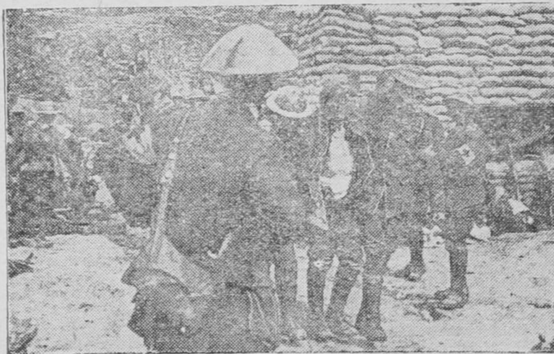
Wounded in the Trenches—Official Film, "Battle of the Somme."