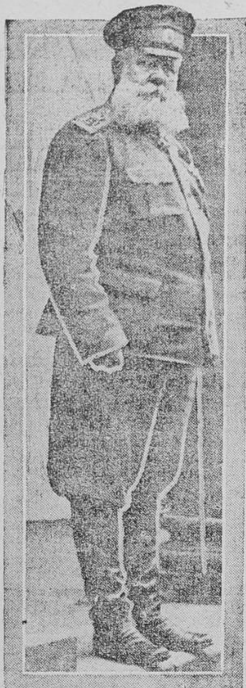
Delivering Smashing Blows Against Germans.

"This torpedo can be directed to take any course and to alter its course at any distance automatically. Suppose a warship or other target to be 2,000 yards from the submarine about to fire a torpedo. The range is set for 2,000 yards plus an additional 500 yards. If the torpedo hits the target within that range its mission is completed, but if it misses it travels on for 500 yards, then swings back, boomerang fashion and zig-zags or circles with a bias in the direction of the moving target until it strikes. The rudder can be so set as to operate the torpedo in a logarithmic spiral. The return of the torpedo