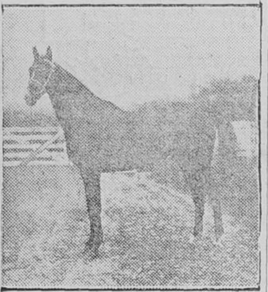
Thoroughbred Stallion "Anmer."

As an encouragement to breeders the Thoroughbred Horse Society has decided to distribute the revenues obtained from "Anmer's" stud fees in premiums at Agricultural Shows to classes of horses sired by a thoroughbred, which are best suited for remount and cavalry purposes.