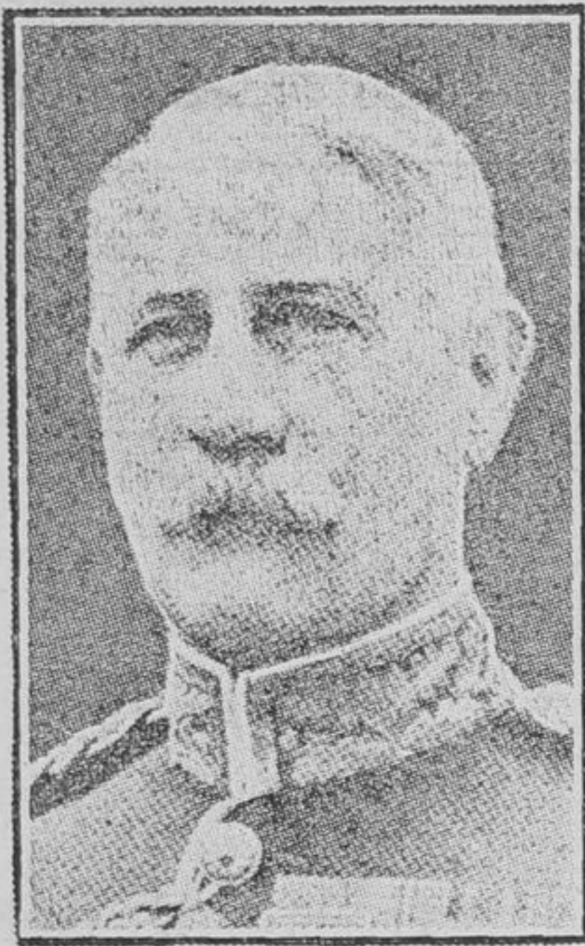
General Sir Stanley von Donop.

The other day a despatch read that Lloyd George had determined that General Sir Stanley von Donop, master-general of ordnance, had to go. This was accompanied by the rather startling statement that Kitchener