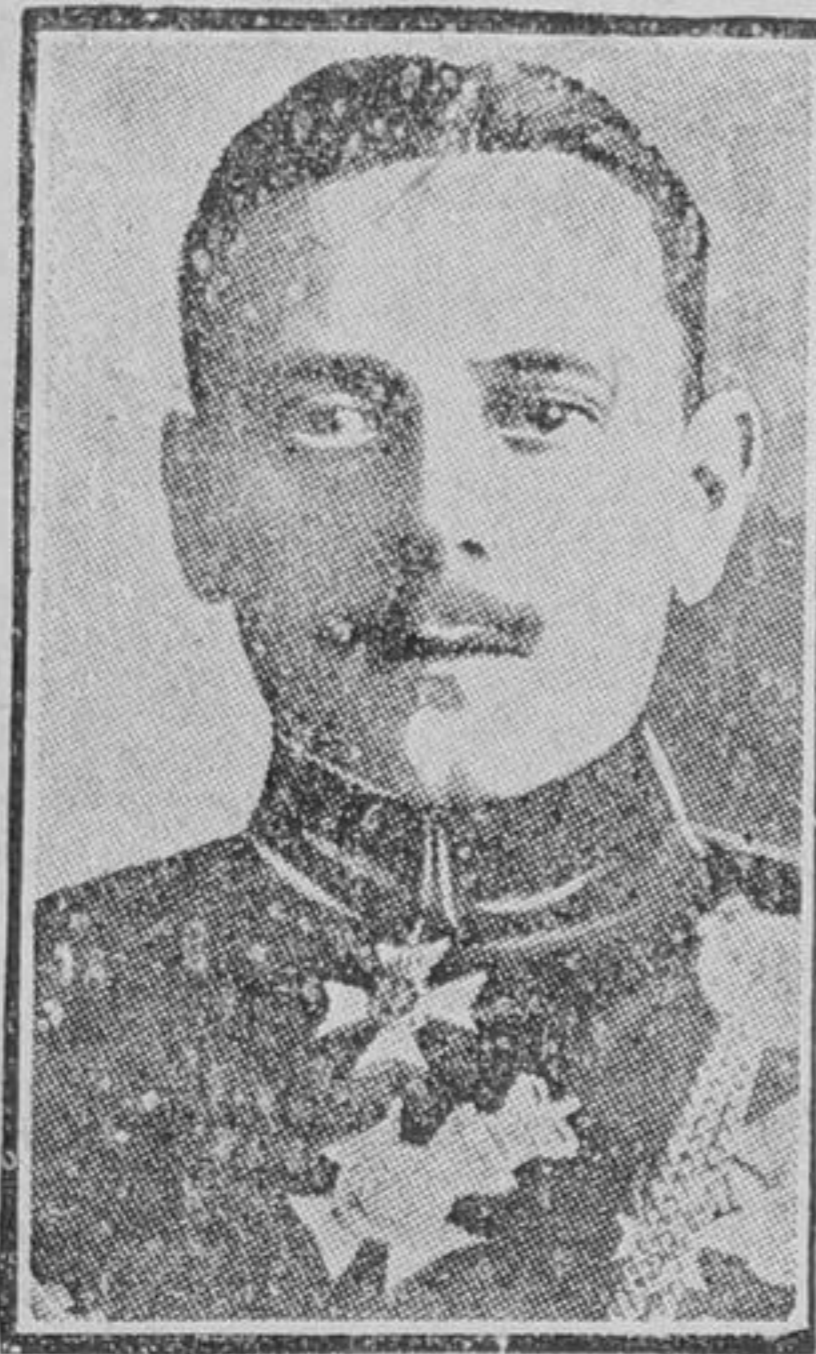
Maurice of Battenberg.

close replicas of the rooms at Sandringham and Marlborough House as possible. The university, which is one of the most notable of its kind in the whole of Northern Europe, though founded less than a century ago, now contains some fifteen hundred students, whose studies are modelled upon those at Oxford and Cambridge. Its library is remarkably complete, comprising some 400,000 volumes, but it has few literary treasures, save some old Norse manuscripts.