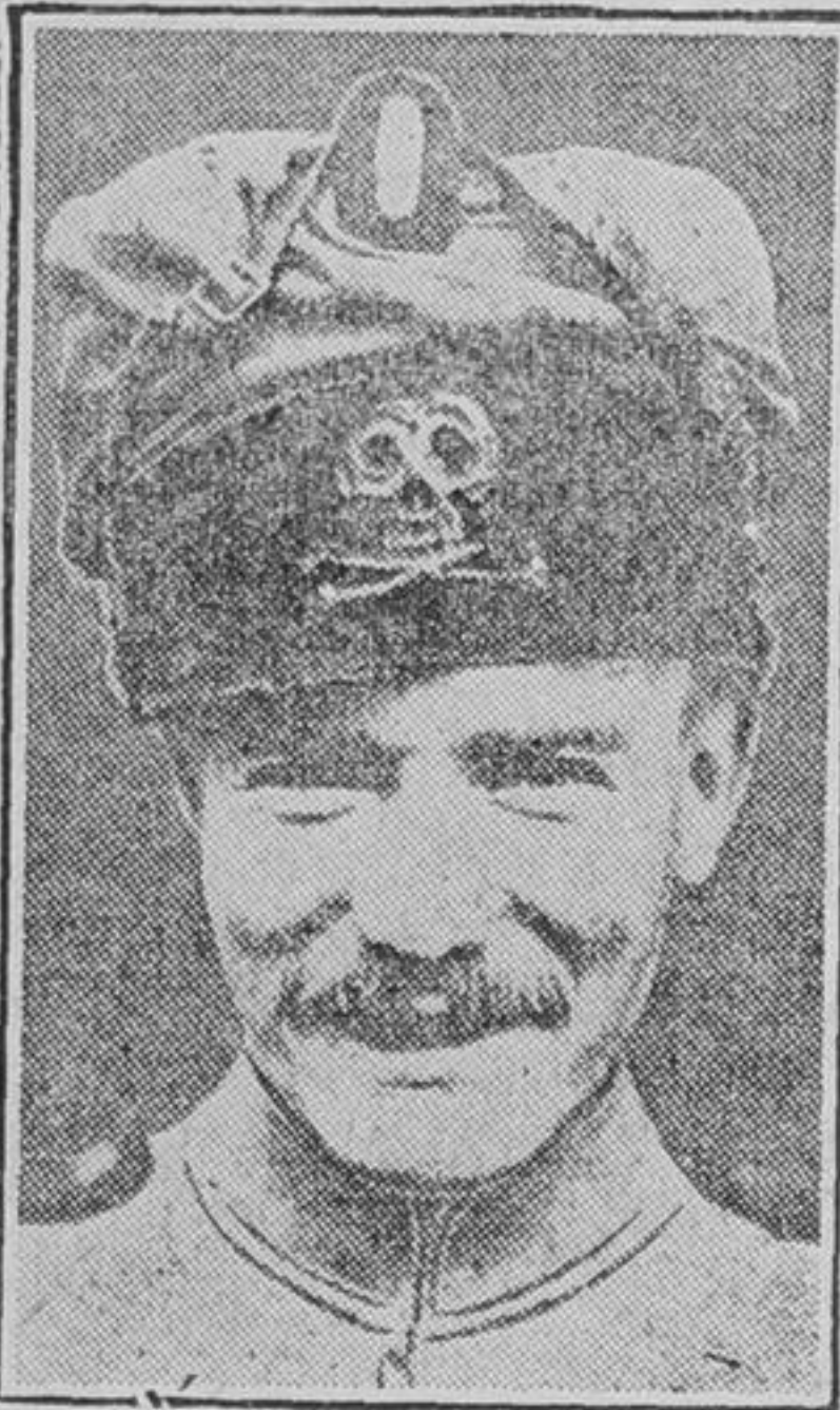
A German Trooper.

Most men reckon time by pay-days. If the play is a frost the audience soon melts away. Brides with sour dispositions are apt to spoil honeymoons. Many a man who is good has a sad look. The tastes of a millionaire may be imprisoned in a pauper's purse. A man who can dispose of his troubles for a consideration is a genius. Pride makes some people ridiculous and prevents others from becoming so.