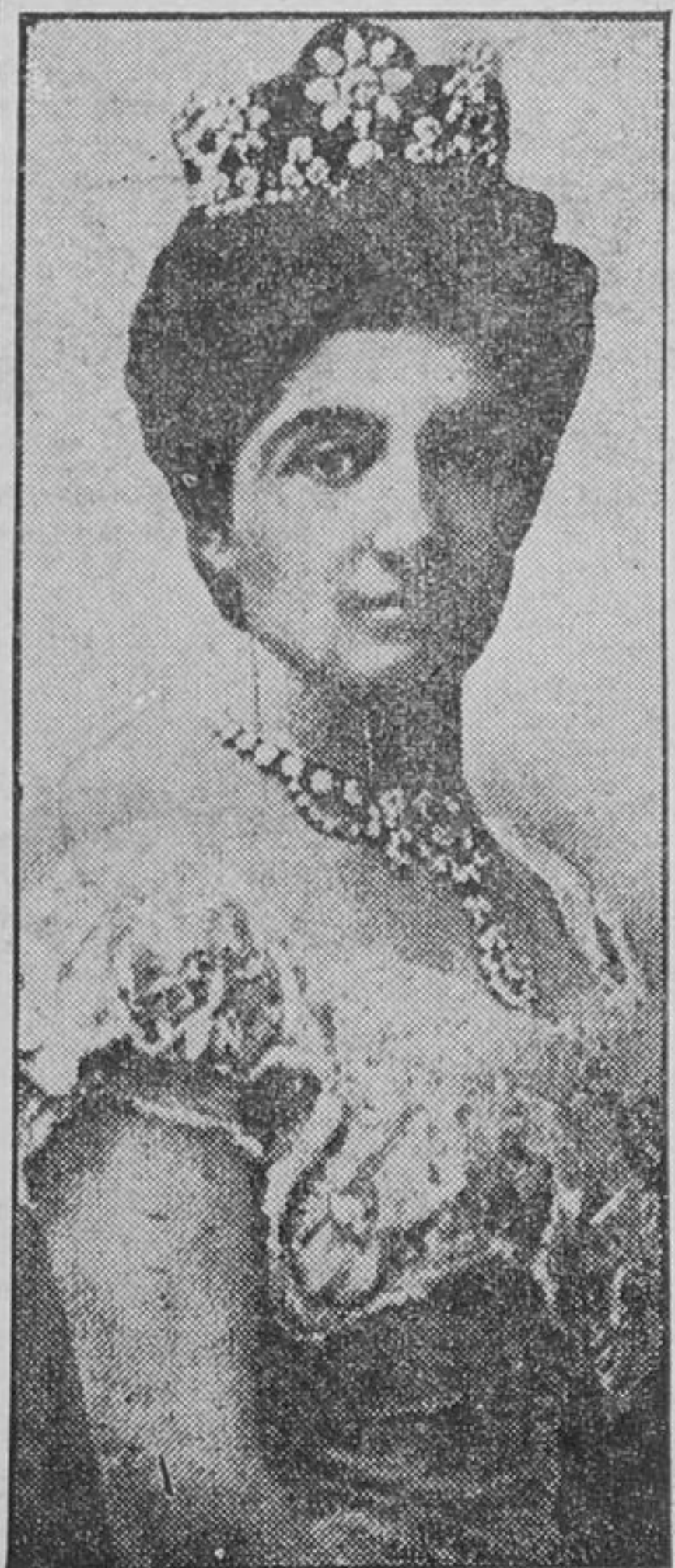
Queen Helene of Italy.

beauty, making its appeal complete, it has often proved equal to stupen-