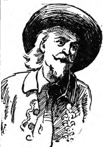
"Buffalo Bill" Cody.

"Being the youngster of the party, I became somewhat tired, and without noticing it I had fallen some little distance behind the others. It was about ten o'clock, and we were keeping very quiet and hugging the bank closely, when I