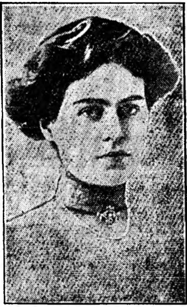
Countess of Pembroke,