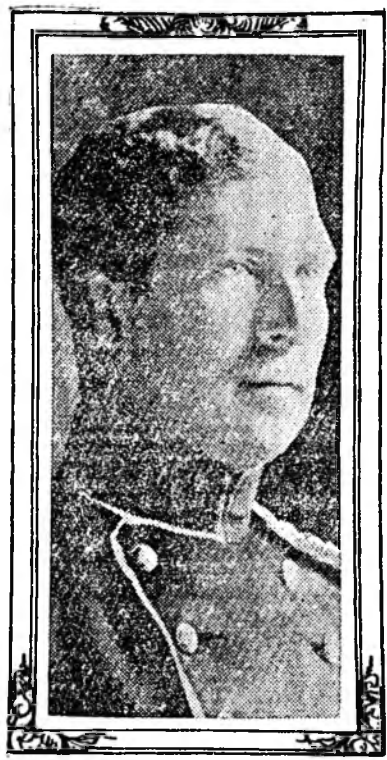
From the last picture of the King of Belgium.