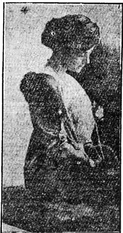
Lady Duff Gordon.

Lady Duff Gordon, better known in the fashionable world as "Madame Lucille," is in no wise ashamed of her chosen calling; indeed she is proud of it, for she considers correct dressmaking, with