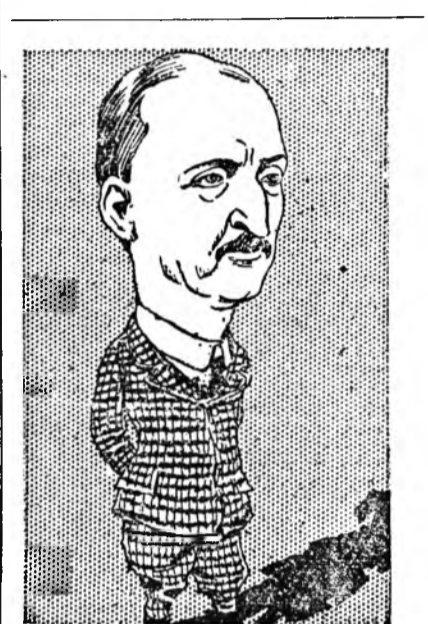
Duke of Marlborough.

The Duke is the head of the powerful Marlborough family, to which Mr. Winston Churchill is related. The first Duke was the famous soldier who gained the great victories of Blenheim, Ramillies, Oudenard, and Malplaquet, and the family have always figured conspicuously in military annals. The present Duke was born forty-two years ago at Simla. In 1895 he married Consuelo, the daughter of Mr. W. K. Vanderbilt, the New York millionaire. He served with the Yeomanry in South Africa, and acted as A.D.C. to Lieutenant-General Ian Hamilton. He has always maintained a keen interest in politics, and from 1903-1905 he was Under-Secretary of State for the Colonies.