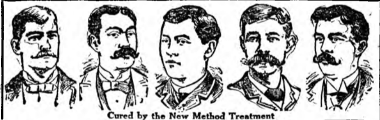
Cured by the New Method Treatment

NO NAMES OR PHOTOS USED WITHOUT WRITTEN CONSENT NERVOUS DEBILITY