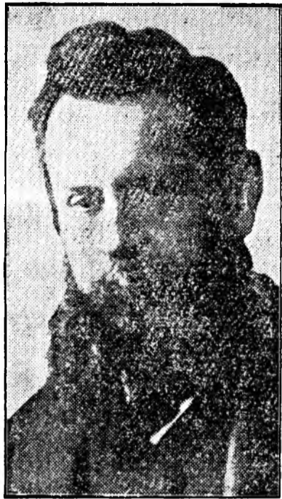
Duke of Norfolk.

As Earl Marshal and Chief Butler of England the Duke of Norfolk is head of the College of Arms, and has, on high ceremonious occasions,