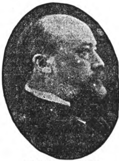
Sir Wm. Van Horne.

The professor stated that in the days when the pressure on the executive officers of the Canadian Pacific demanded an almost constant service and unwearied vigilance and initiative, Sir William