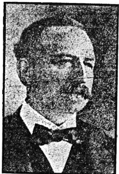
Sir Thomas Shaughnessy.

Sir Thomas Shaughnessy, the C. P. R. president, is somewhat noted for his quaint wit. On one occasion a pompous young man with very high notions of his own importance, consulted him in regard to choosing a vocation for life. He said, "Sir Thomas, as you have been a very successful man, I am sure you are capable of giving excellent advice to a young man just starting in life. What business would you advise me to engage in?" "Shoemaking," was the senti-