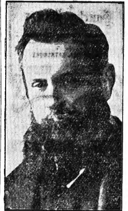
Duke of Norfolk.

To crown all, he was once taken for a beggar. The occasion was a distribution of prizes at a big convent, and he was to be the central