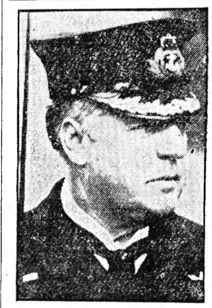
Lord Charles Beresford.

Lord Charles Beresford and the Duke of Argyll were travelling together on the Great Western Rail-way, in England. The only other occupant of their compartment was a prosperous drummer, whose success had been due to natural talent for business rather than to sound education. The noblemen found their companion entertaining, so they listened to his talk until a small station in Gloucestershire was reached. Here Lord Charles Beresford alighted, and was met by a servalt of the people with whom