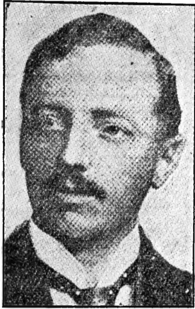
Dr. T. J. Macnamara.

One relates to a young and enthusiastic teacher who was trying