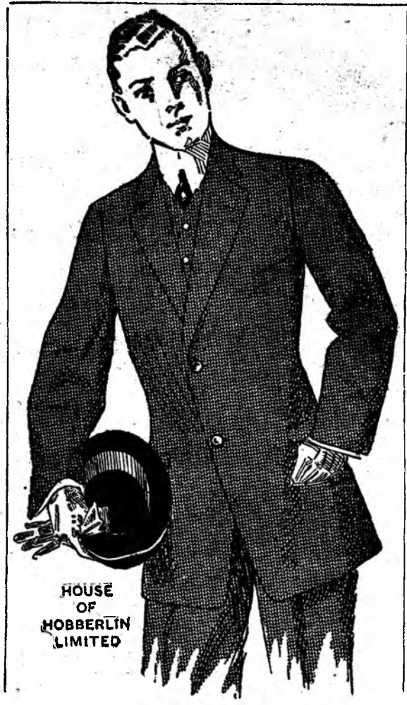
HOUSE OF HOBBERLIN LIMITED