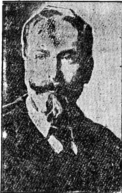
Prince Louis of Battenburg.