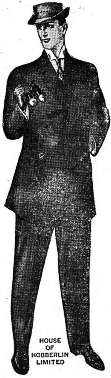
HOUSE OF HOBBERLIN LIMITED