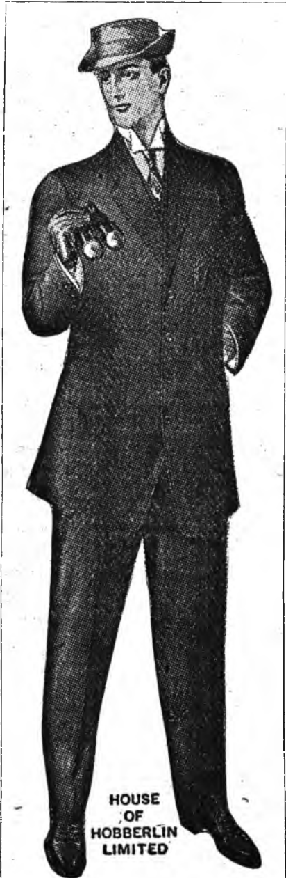
HOUSE OF HOBBERLIN LIMITED

WE are sole agents for "Hobberlin" tailoring. The sort of tailoring known as "safe tailoring." By an accurate system of measurements mistakes are rare—if there are any we will refund every dollar paid us. We make garments to your personal measure only, cut and designed by "The House of Hobberlin" experts. Come here for your Spring Suit.