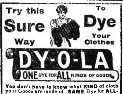
You don't have to know what KIND of cloth your Goods are usede of. SAME Dye for ALL-No chance of Mistakes. All colors to cents from your Druggis, or Dealer. Sample Card and Booklet Free. The Johnson-Richardson Co., Lin ited. Dept. C. Montreal, Que.

Blobbs-"A woman is always illogical." Slobbs-"Of course she is. her age."