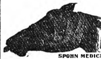
SPORN MEDICAL CO., Chemists and Bacteriologists, Goshen, Ind., U. S. A.

A flavoring used the same as lemon or vanilla. By dissolving granulated sugar in water and adding Mapleine, a delicious syrup is made and a syrup better than maple. Mapleine is sold by grocers. If not send 50c for 2 oz. bottle and recipe book. Crescent Mfg. Co., Seattle, Wa.