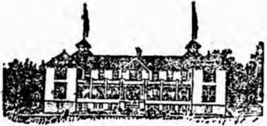
MUSKOKA FREE HOSPITAL FOR CONSUMPTIVES. MAIN BUILDING FOR PATIENTS.

THEN SEND YOUR CONTRIBUTIONS TO THE MUSKOKA FREE HOSPITAL FOR CONSUMPTIVES