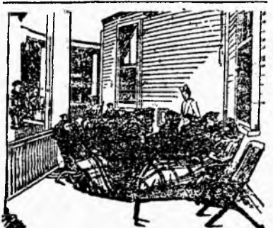
TAKING THE CURE IN WINTER AT MUSKOKA FREE HOSPITAL FOR CONSUMPTIVES.