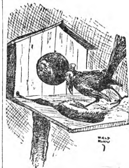
"That old hairbrush is certainly a success as a doormat."—Life.

Conscience is something those who need it haven't got.