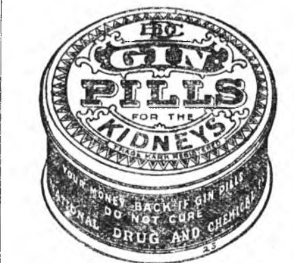
Send for free sample to Dept. W. L., Na- tional Drug & Chemical Co., Toronto.