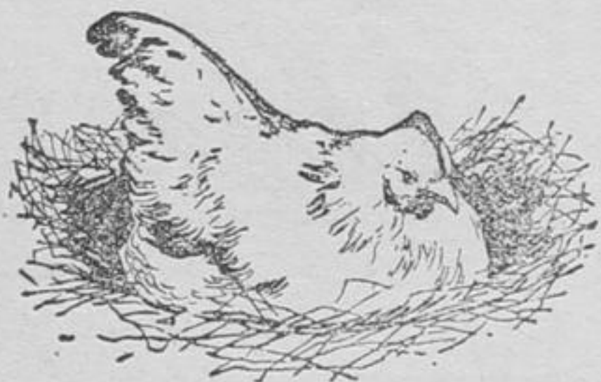
THE SETTING HEN—Her failures have discouraged many a poultry raiser.