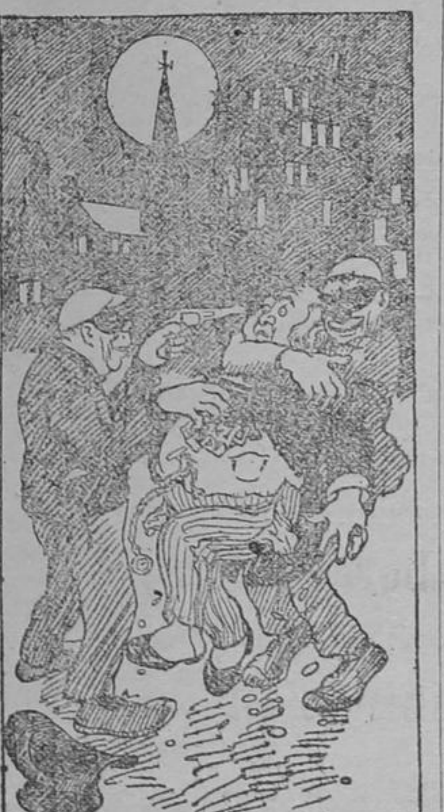
FINANCIAL TERM, "Squeezed for Money."

Mrs. Long—"I'm glad to hear it. I expect she saw she was making herself ridiculous."