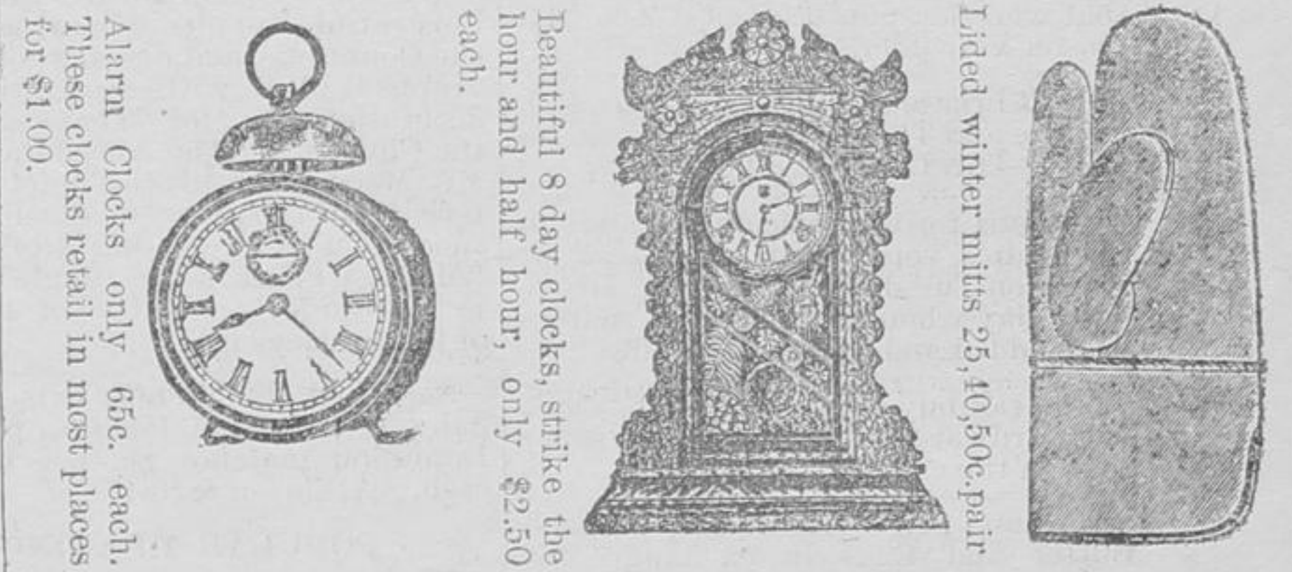
Alarm Clocks only 65c. each. These clocks retail in most places for $1.00.