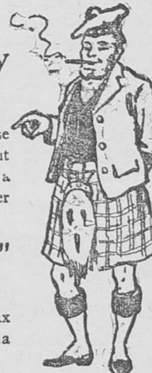
EMPIRE TOBACCO CO., MONTREAL.

it's no because I'm Scotch but you canna smoke a better Cigar than "ROB ROY." They cost 5c. but I get sax of them for a quarter.