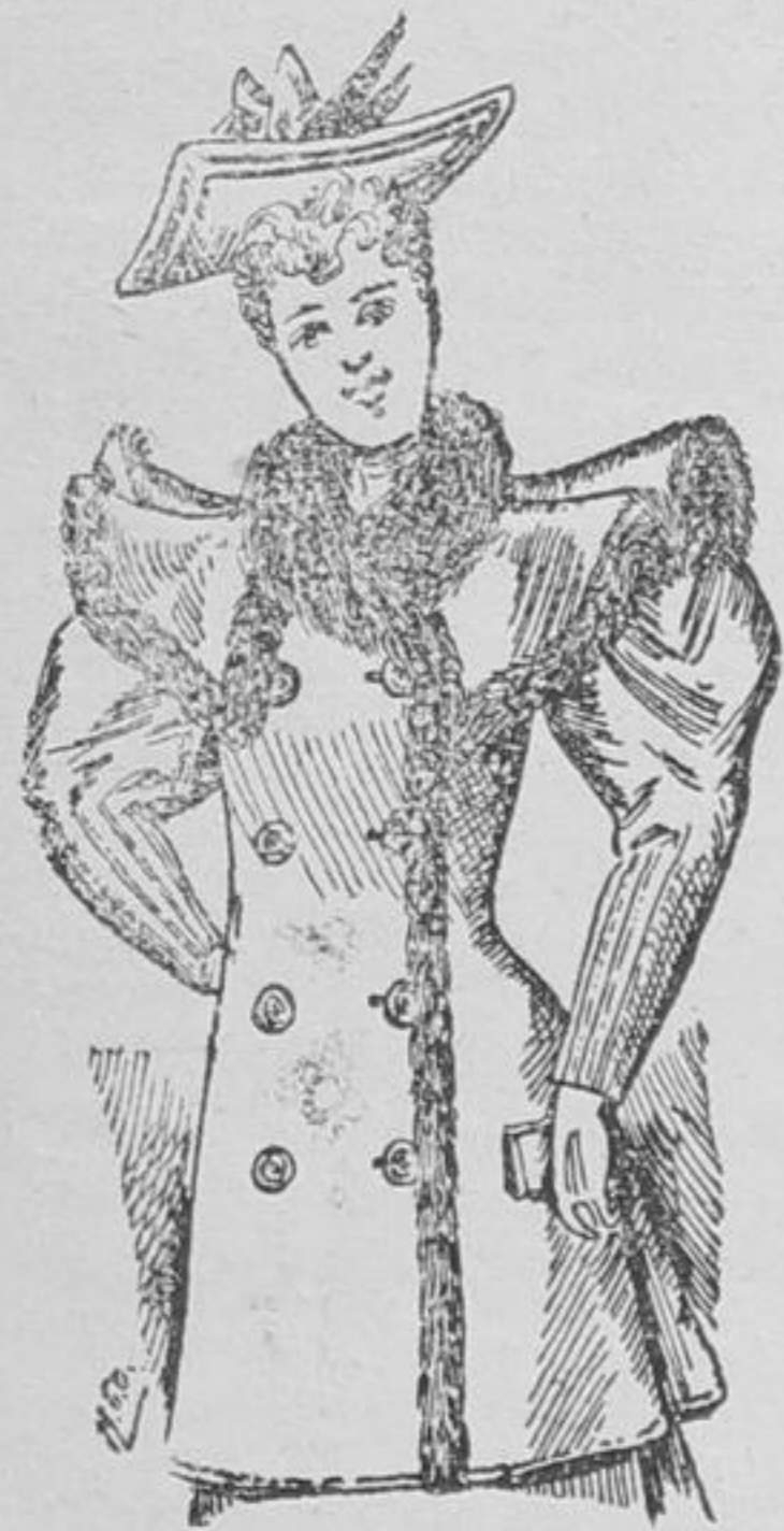
Three-quarter Length Coat, with Butterfly Cape. Sable Trimming.

OUR collection of Mantles, Jackets and Capes is now complete. England, France and Germany have contributed their best towards this magnificent collection of Ladies' and Children's Overgarments, which we show in our large and elegant Mantle Department. The Mantle Department is the busiest part of the store these days, and we extend a most cordial invitation to every lady visiting Toronto to see what we believe to be the finest exhibition of Ladies' and Children's Cloaks and Wraps in the city.