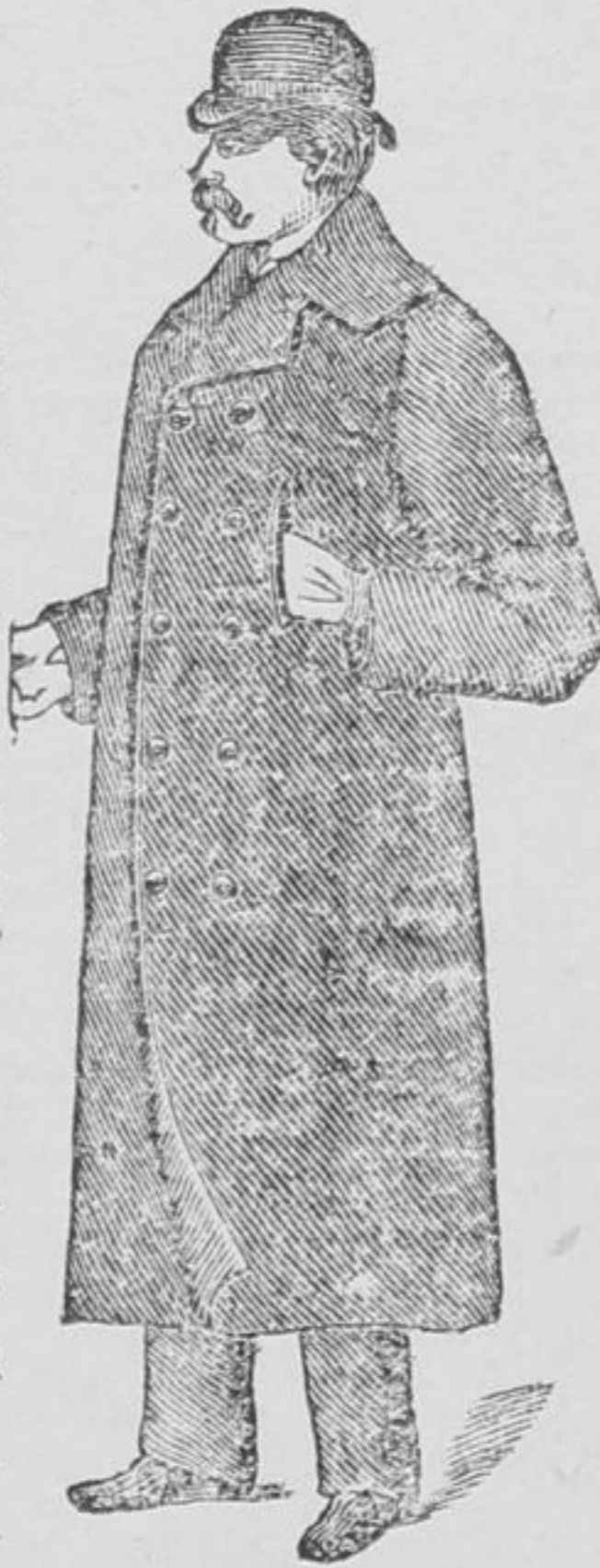
Double-Breasted Ulster. Storm Proof.