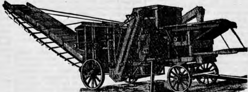
THE MORRIS DOUBLE DRESSER.

It has a SMUTTER and SECOND FANNING MILL attached.