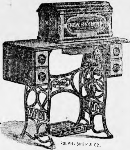
ROLPH, SMITH & CO.

Having secured the agency for selling the New Raymond Sewing Machine, I respectfully solicit the patronage of all those in need of a first class machine. Those machines have the modern style of high arm; they run smoothly and quietly; have a first-class set of attachments; every machine fitted with the celebrated automatic bobbin winder, in fact have all the latest improvements. The Raymond is the favorite machine for the family for all classes of work, and the price within the reach of all. Do not be persuaded to buy any other machine, but secure a New Raymond.