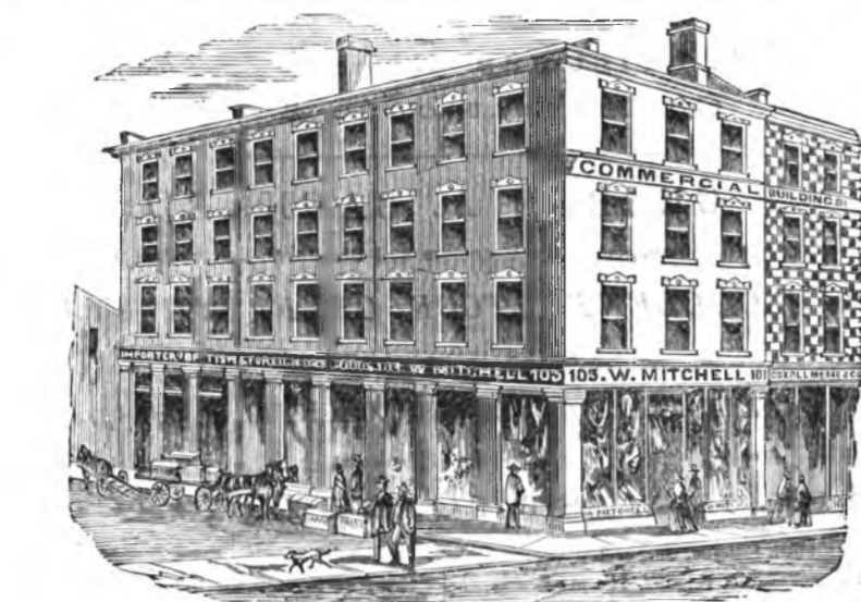
SCOTCH CLAN TARTAN WAREHOUSE 103 KING STREET, CORNER OF CHURCH STREET, TORONTO.

DRINK IN MODERATION.—A Scottish parson once preached a long sermon against dram-drinking, a vice very prevalent in his parish, and from which, report says, he was not himself wholly exempt.