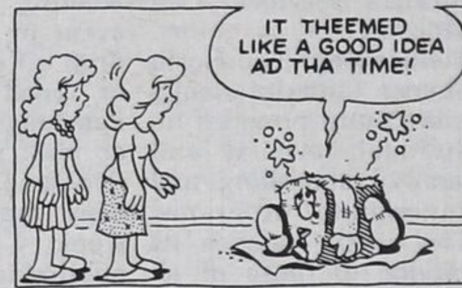
Got a crush on someone? Let them know with a personal ad!