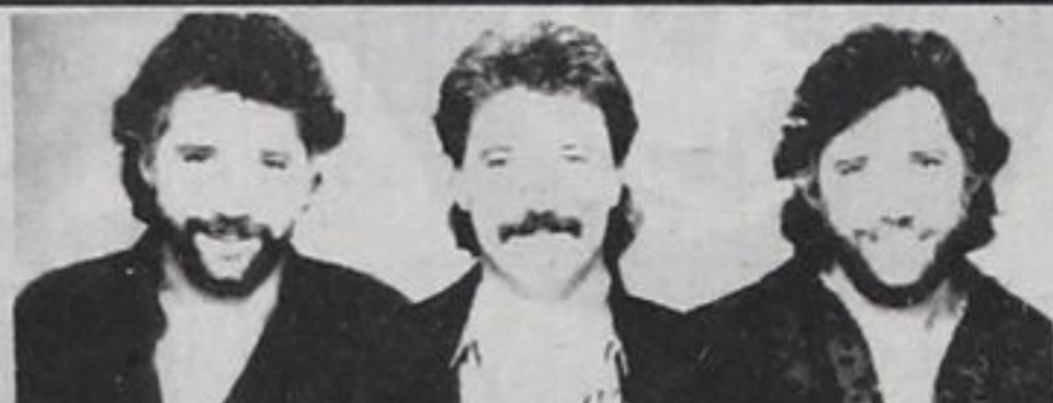
The Good Brothers