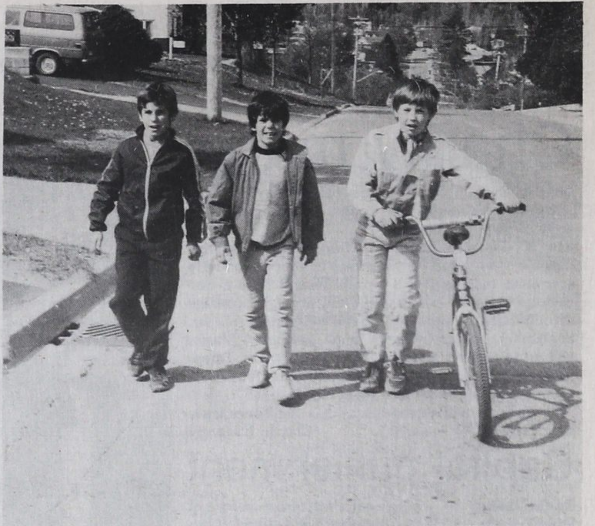
In the lead