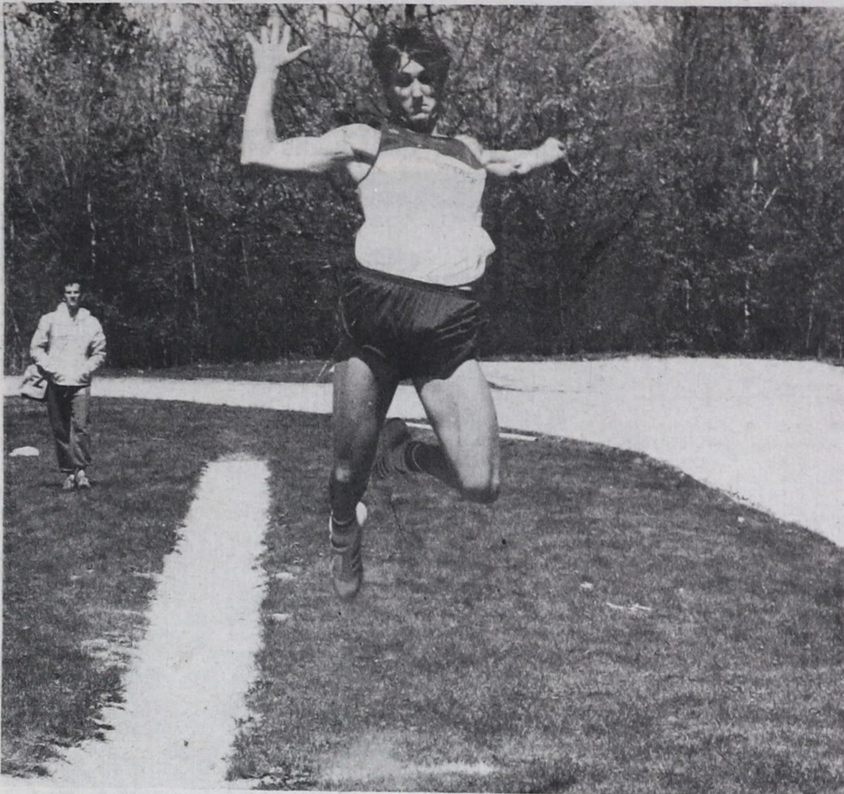
In the air