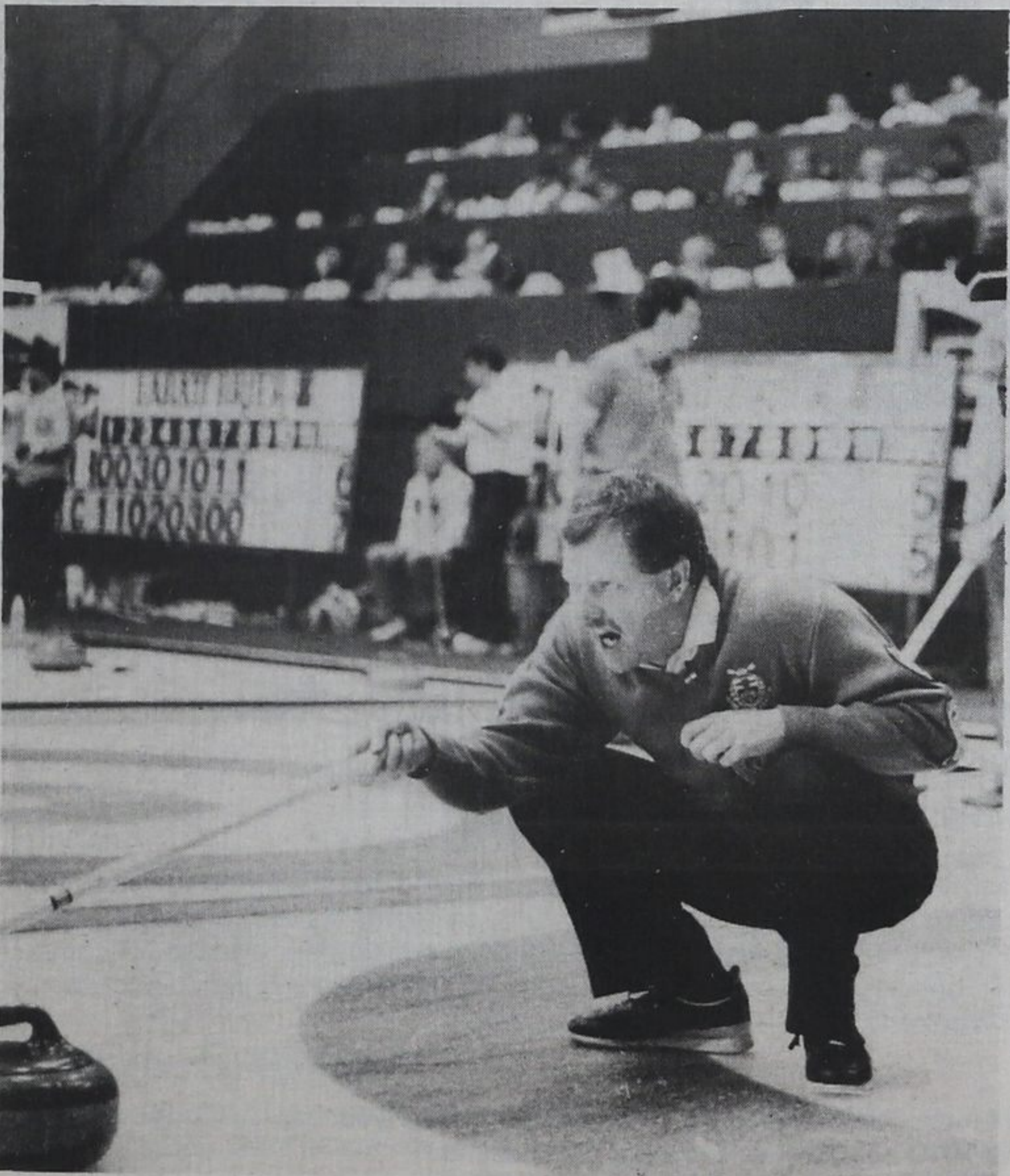
Playing to win