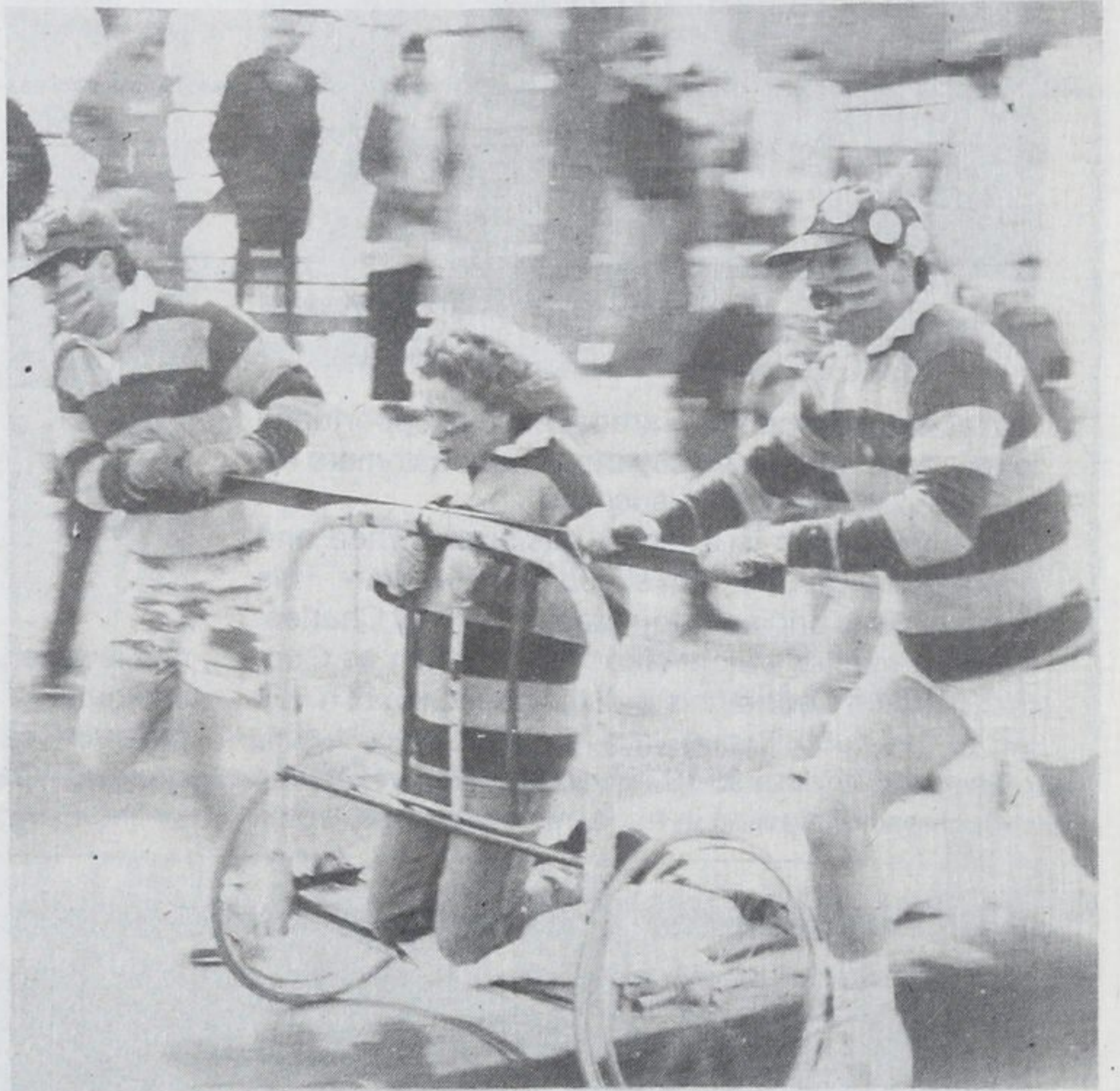
Racing to the finish