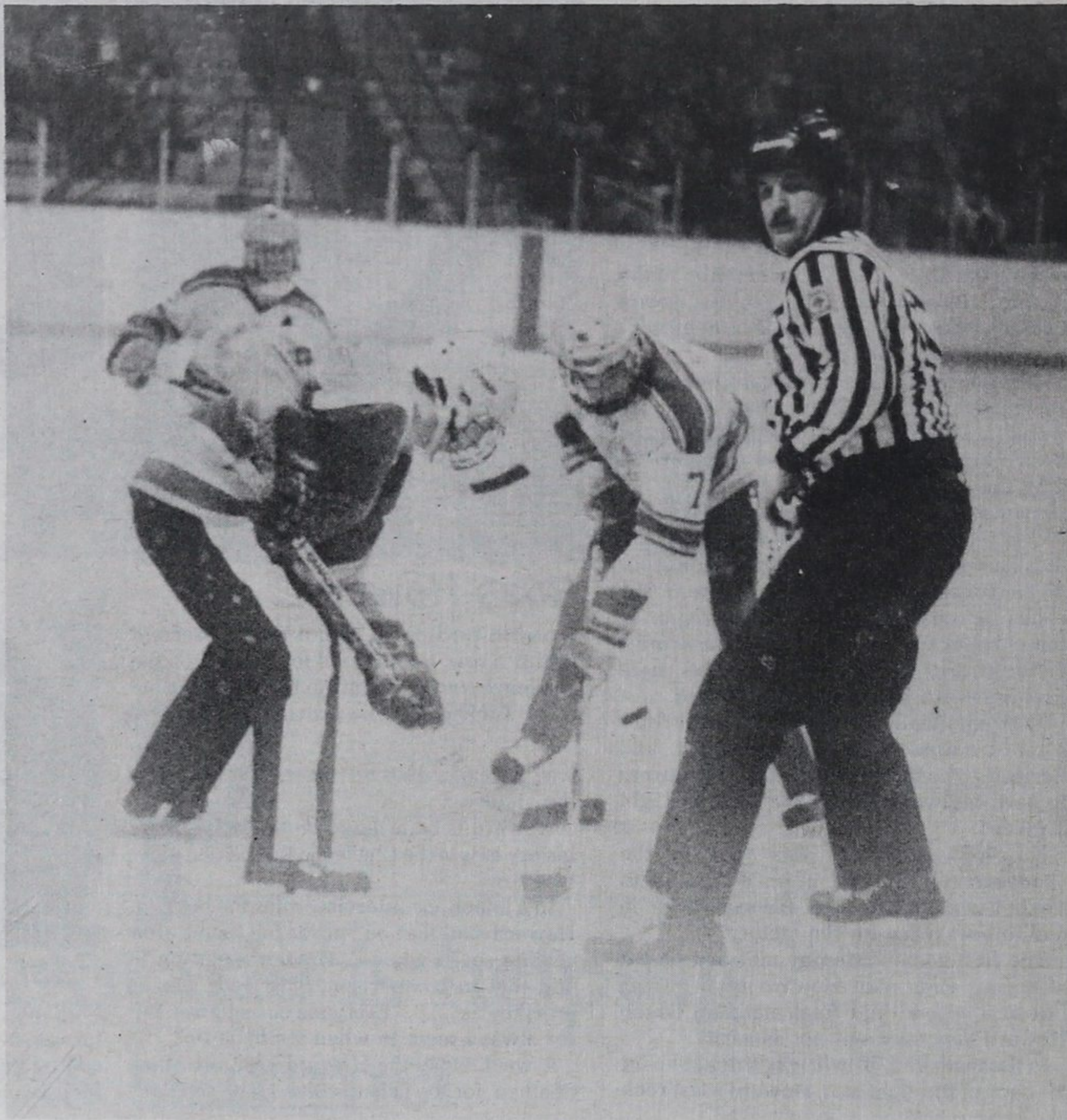
Out of the way