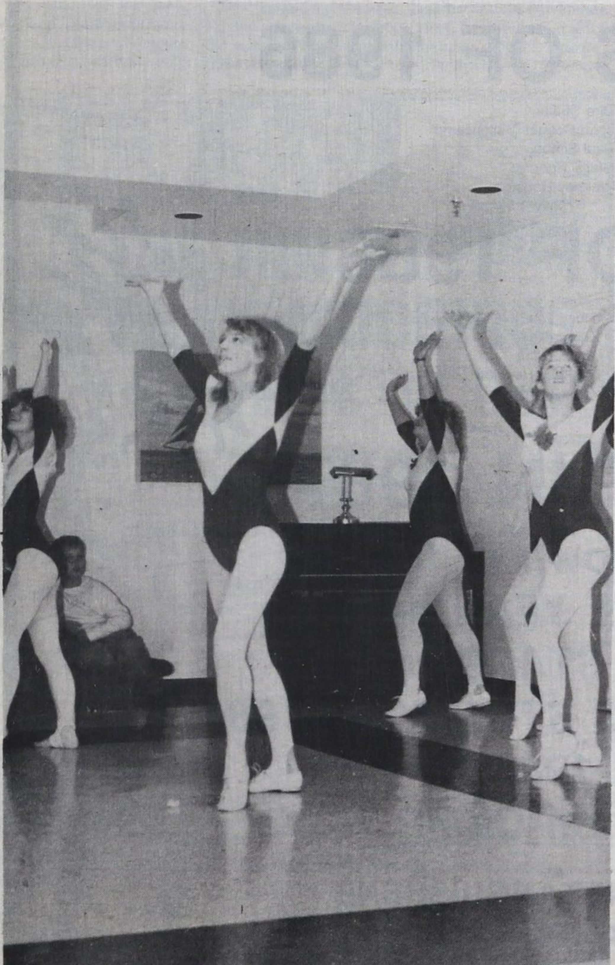
An expression of joy

The MP also reviewed Conservative initiatives in the area of social legislation, including the de-indexing of the pensions of federal civil servants.