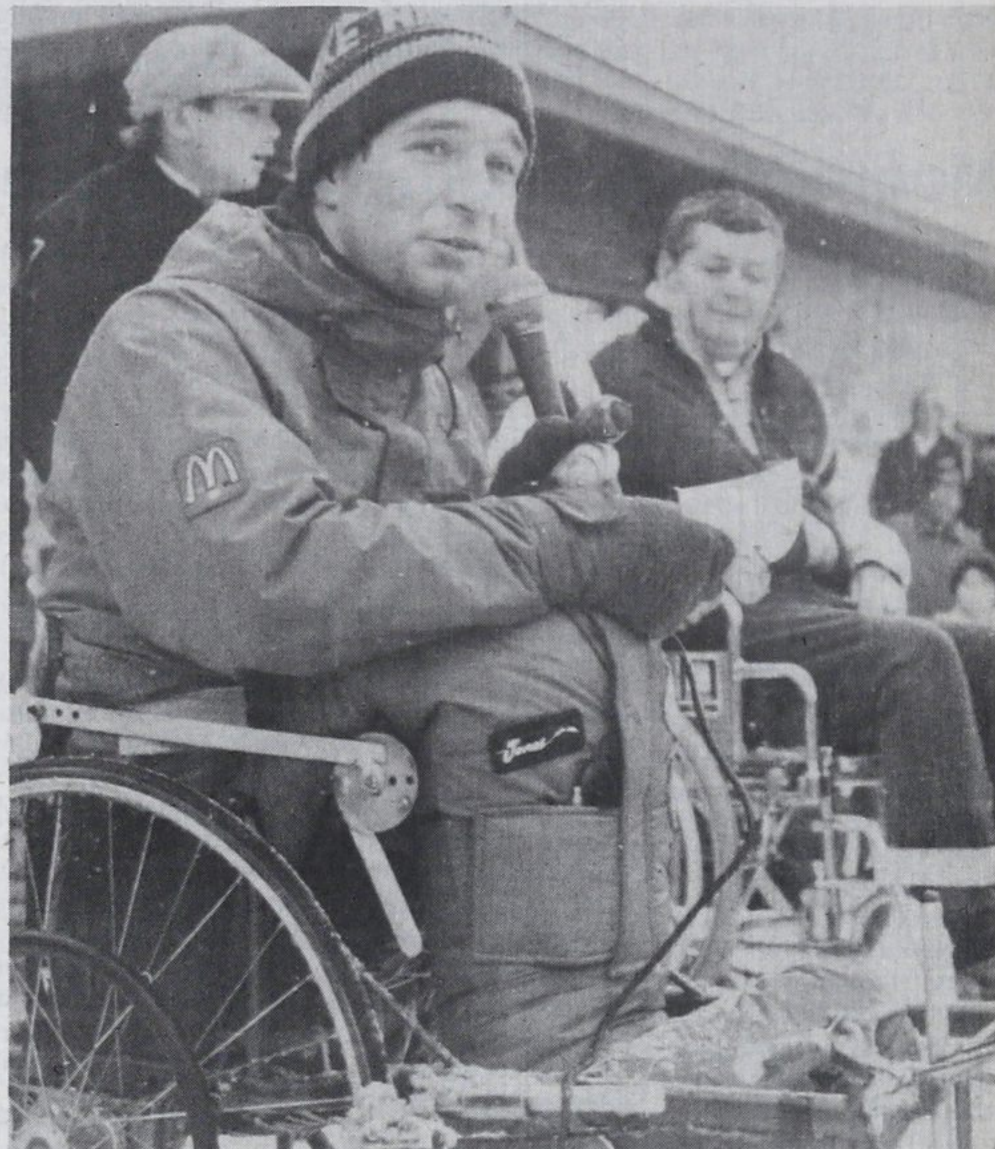
Man of the hour

Since leaving last March the athlete has raised over $10 million for spinal cord research. One third of that was raised in Canada alone.