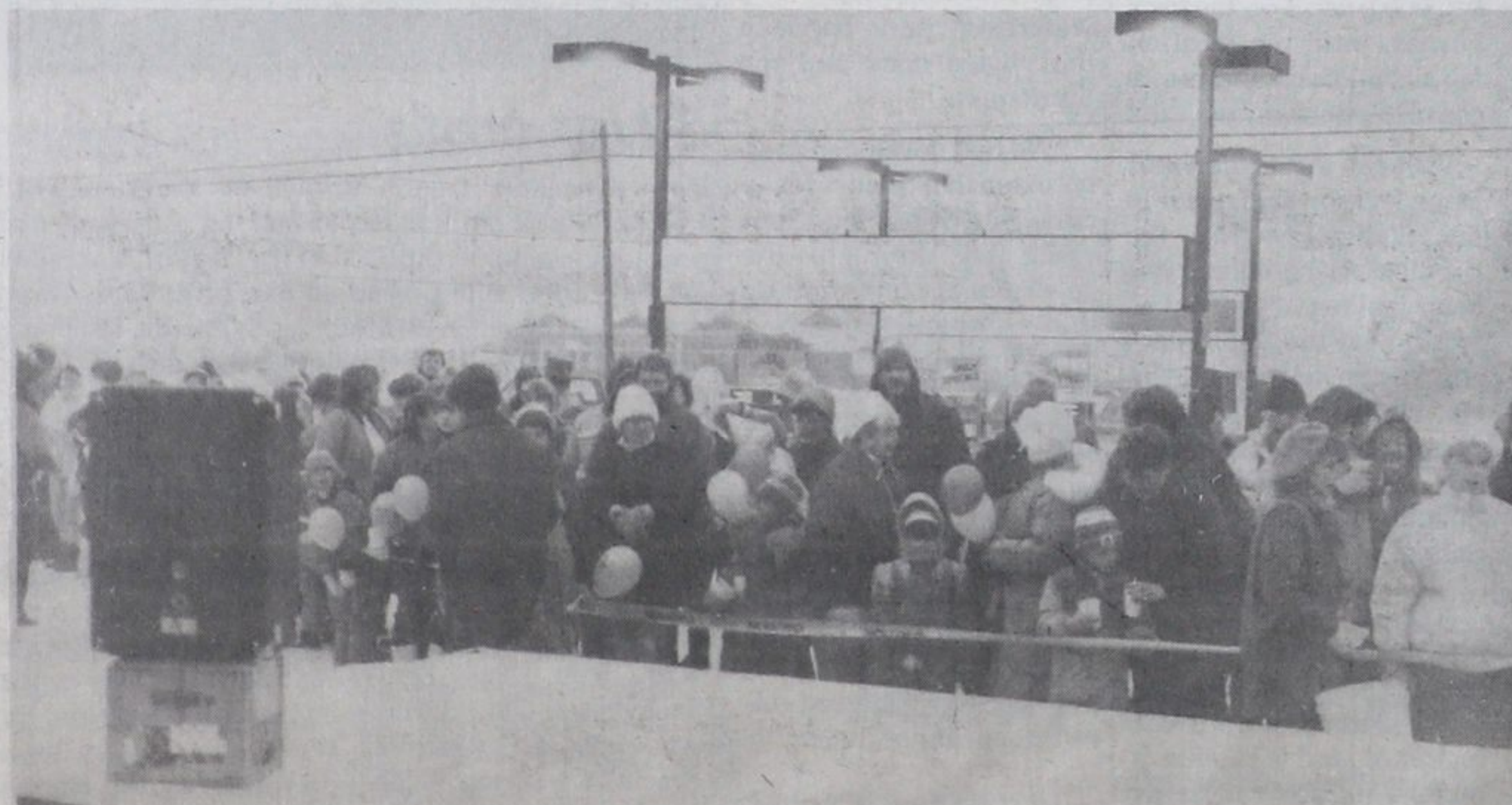
Early morning crowd