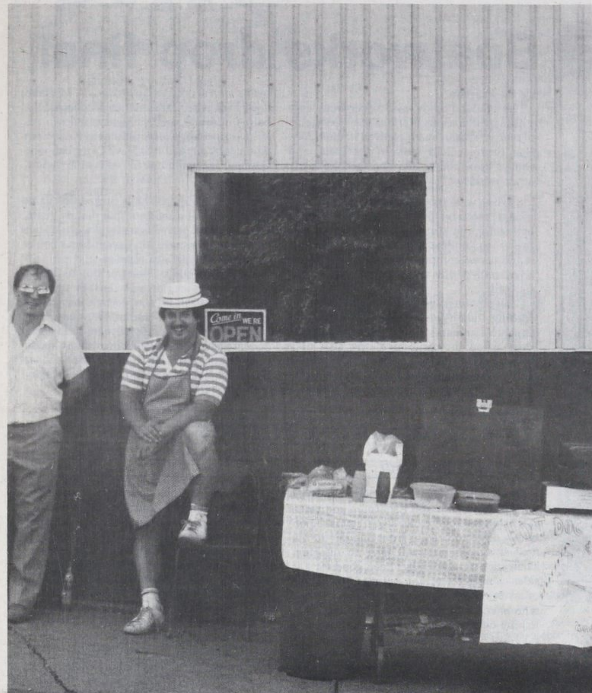
Hotdogs for sale