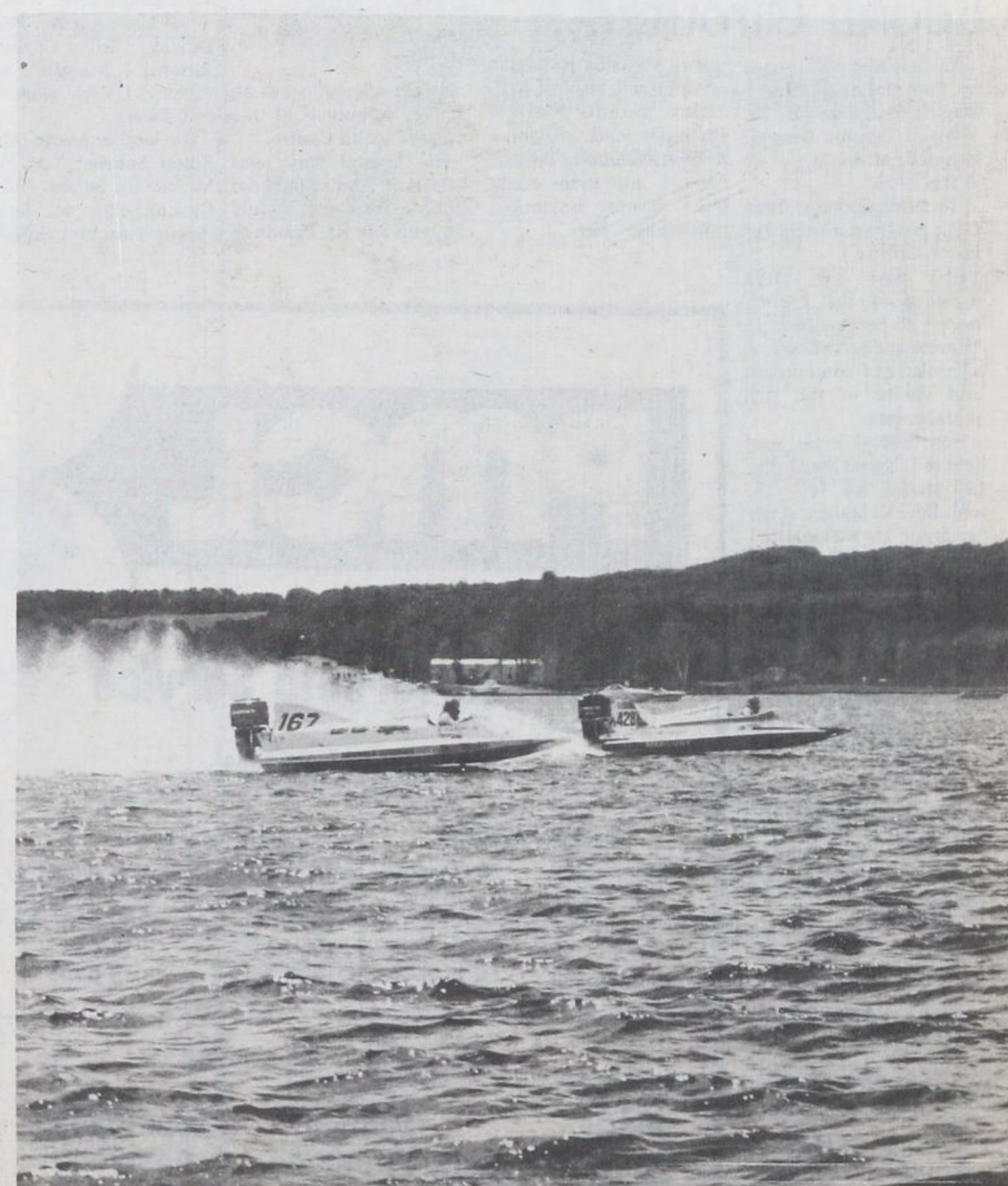
Catching the leader