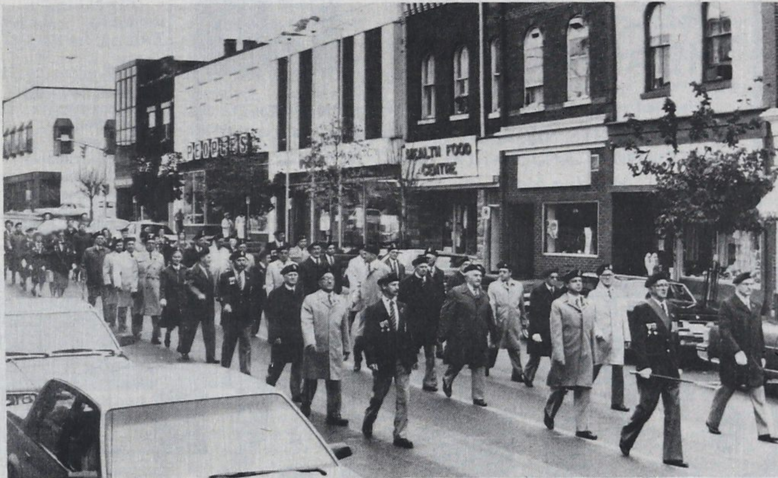
They march in memory of fallen comrades

If elected I will give my undivided attention to this worthy project and all other matters affecting the progress of Coldwater.