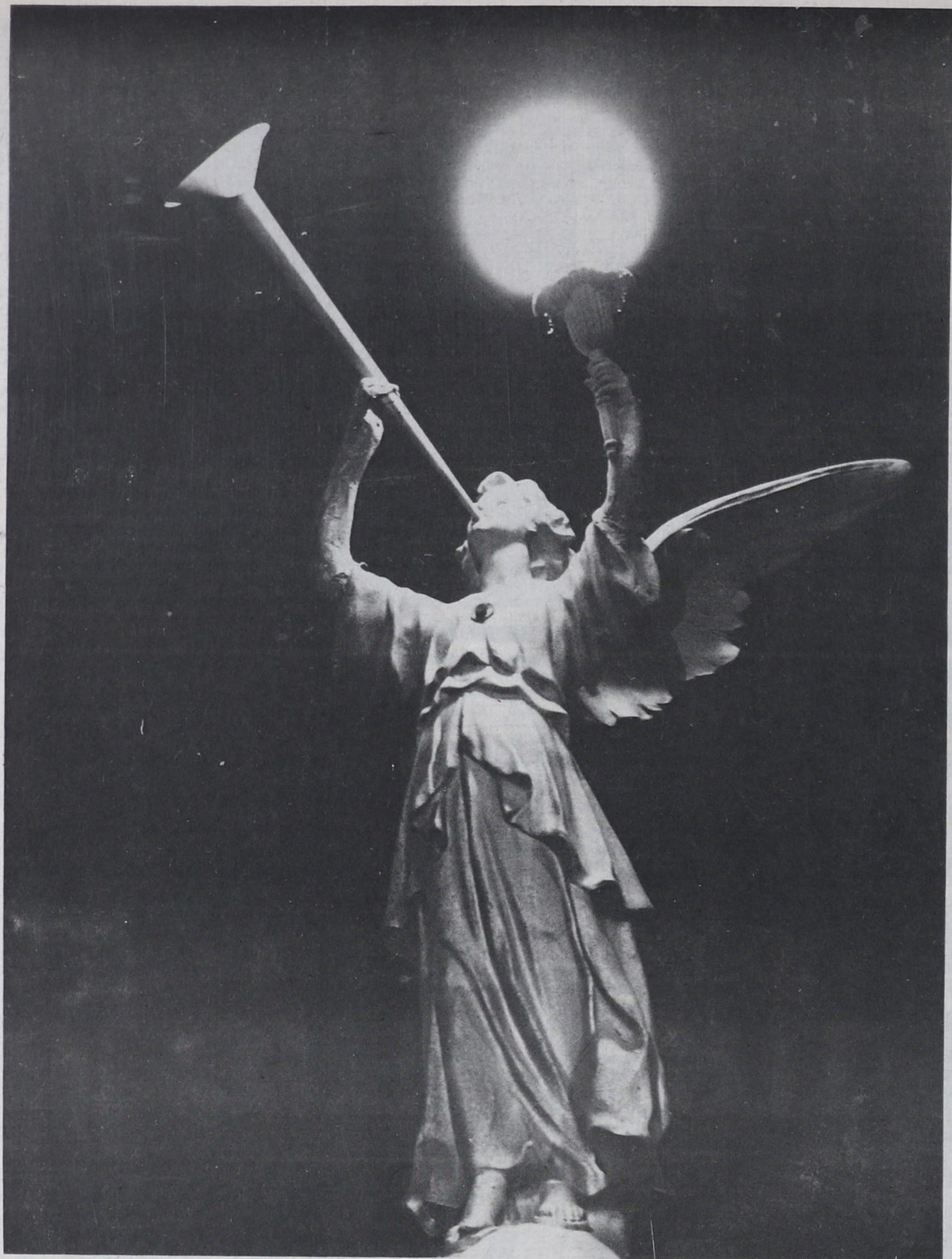
STANDING ON GUARD : This popular Penetanguishene landmark and her sister have been a photographer's delight since they were installed many decades ago