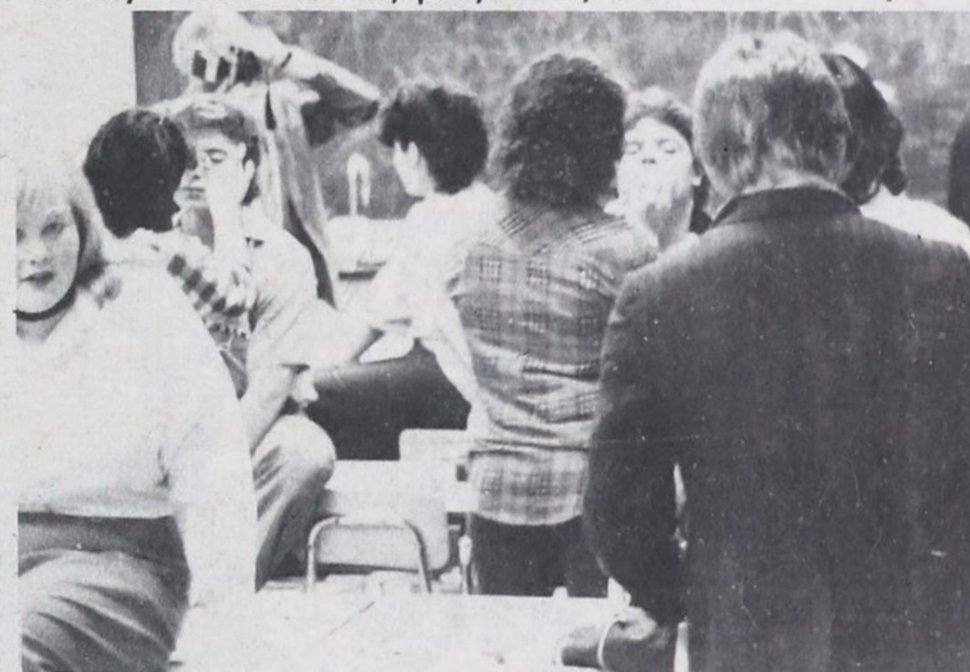
Last minute make-up touches