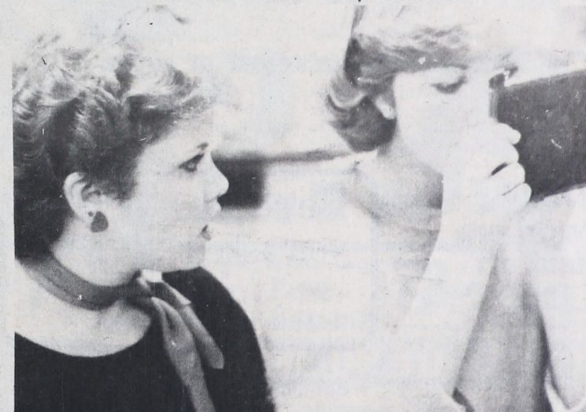
'You look fine, just don't forget your lines'