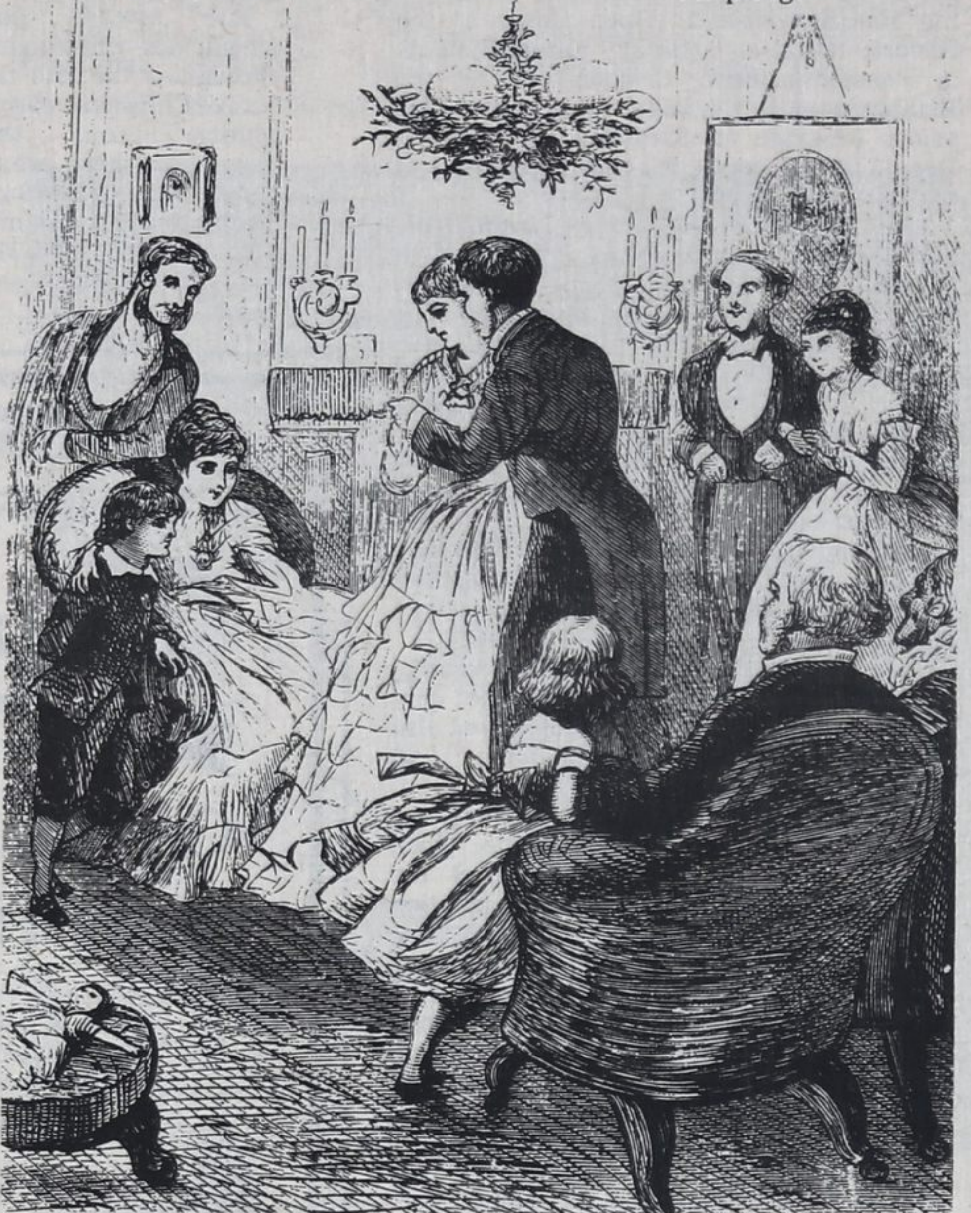
A NINETEENTH CENTURY GENTLEMAN seizing a kiss under the mistletoe, a custom which prevails to the present day.

The evening closed with the repeating of the 4-H pledge.